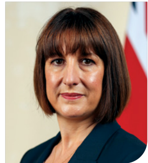
Official portrait of Rachel Reeves MP, by Lauren Hurley, licensed under Open Government Licence v3.0

The OBR, blushing from its pre-emptive publication of documents on the day, at least managed to summarise matters neatly: "...the Budget delivers a frontloaded increase in spending of £9 billion and backloaded increase in taxes of £26 billion".